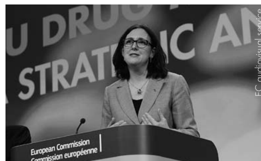
Malmström: ‘EU drug markets report offers unique analysis’.